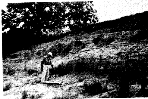
A. Roadcut 2 miles south of Paige by Farm-to-Market Road 2104