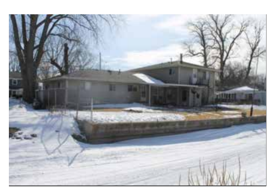
Figure 4: View looking east toward properties across the channel