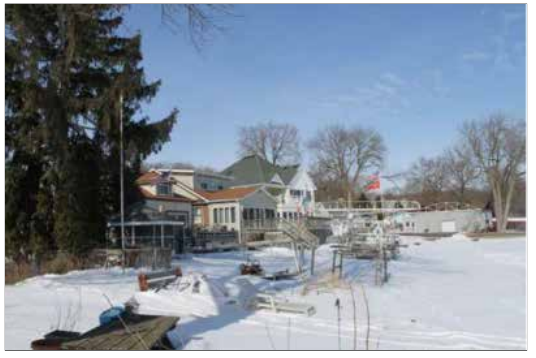
Figure 3: View looking west toward adjacent properties on the bay