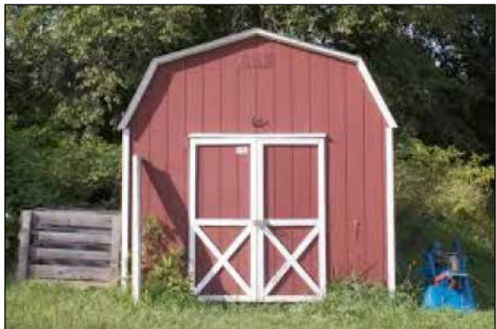
Figure 6: Outbuilding constructed in 1975 is located 55 feet west of the back of the house. This structure will be removed as part of the mitigation project.

Description: Please describe and indicate if any structures affected by the elevation project are listed in any local, state or National Historic Register.