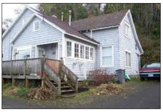
Figure 2: Back and west side of the house