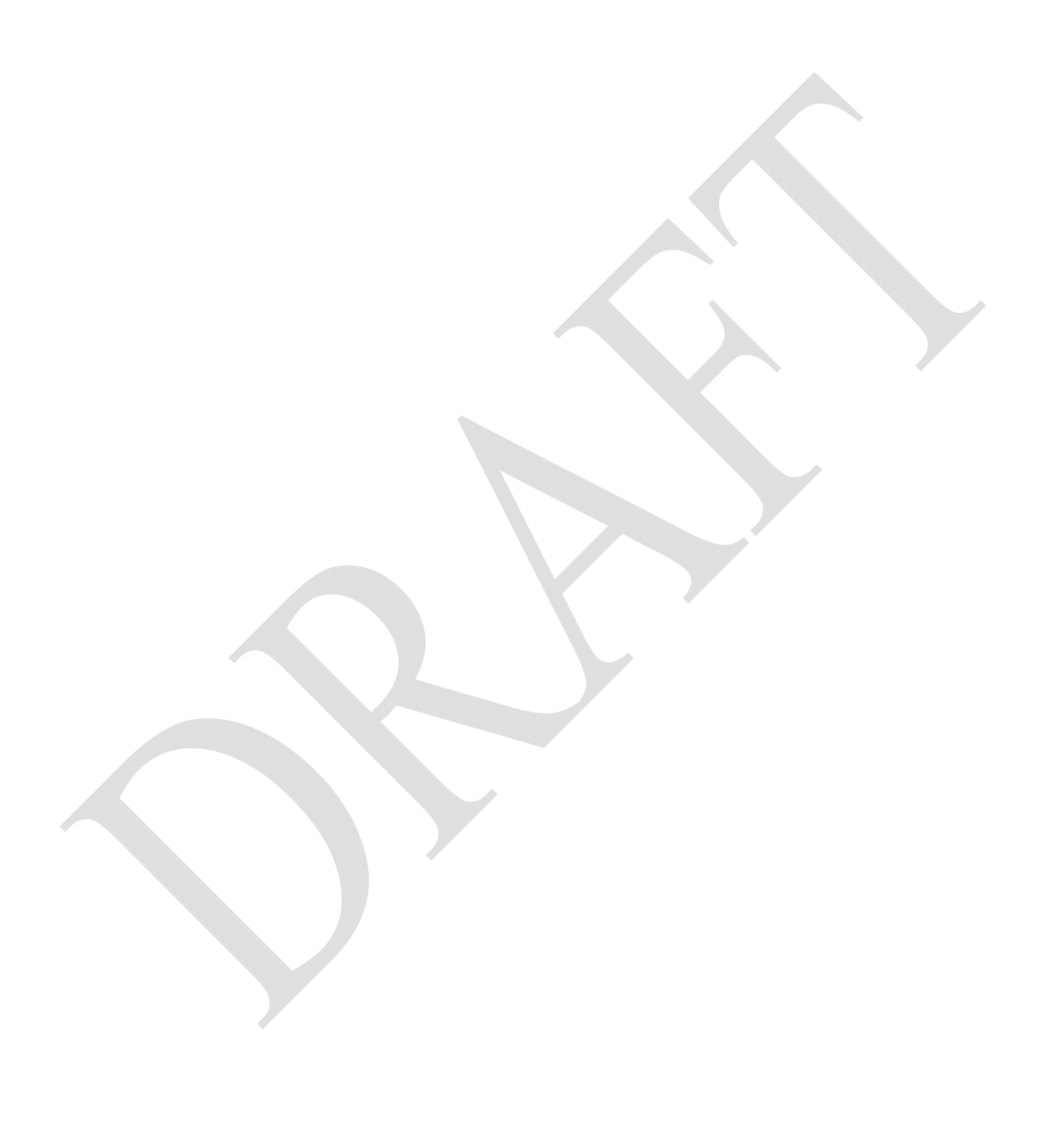
APPENDIX A-2 SIGNIFICANT BORROWER INFORMATION