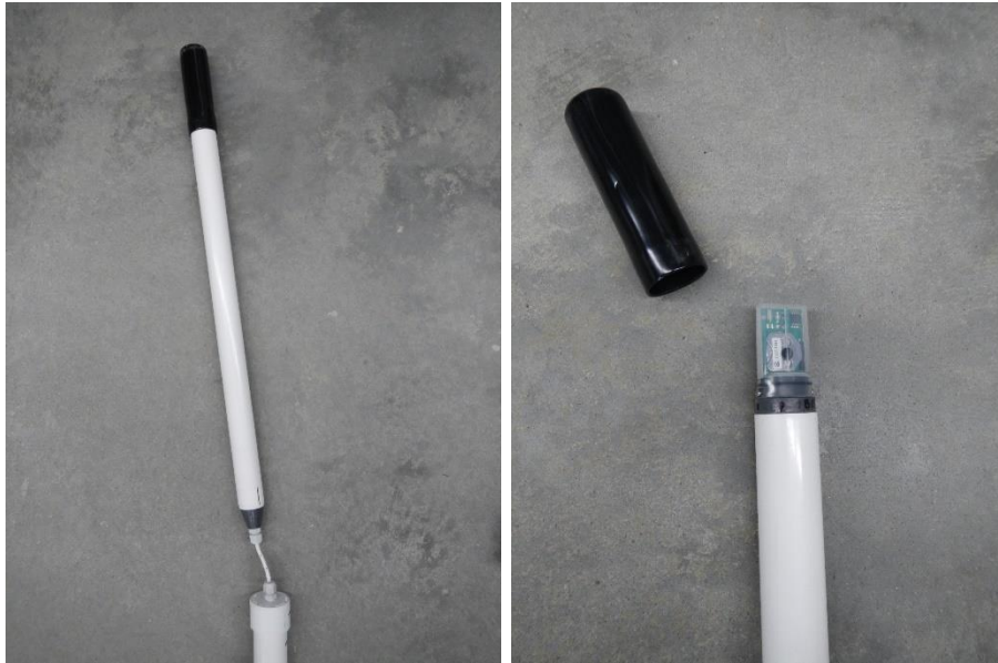
Figure XX Pre-deployment photograph of a tilt current meter attached to its tether and a close-up of the HOBOTM pendant underneath the cap on top of the meter.

OkeanoLog SeaHorse tilt current meters consist of a buoyant 2.5 cm diameter PVC rod with a HOBOTM Pendant G Data Logger fixed to the top and a 4 cm flexible tether to moor the meter at the bottom. These tilt current meters are well adapted for use in shallow estuaries. Their relatively low cost allows for the deployment of multiple meters in different locations, and internal data storage allows them to be deployed for extended periods of time. They also lack external moving parts, which makes them less susceptible to data loss from fouling than mechanical flow meters. Data collected during side-by-side field deployments of tilt meters and acoustic Doppler current meters have shown very good agreement between the two instruments despite their vast difference in complexity (unpublished data).