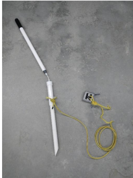
Figure XX Pre-deployment photograph of the tilt meter deployment assembly consisting of the meter tethered to a PVC stake and a weight attached to the stake with a polypropylene rope.

The meters were retrieved roughly once every 2-4 weeks (2 weeks during warmer seasons, 4 weeks during cooler seasons) to offload data and check for fouling. A grappling hook was used to snag the rope strung between the meter and the weight at each station, and the rope was used to pull the stake loose from the sediment and bring the meter to the surface. A HOBOWaterproof Shuttle was used to offload data from the loggers in the field and reset them for immediate redeployment after the removal of any fouling. Instruments that were damaged or missing were replaced if extra tilt meters were available.