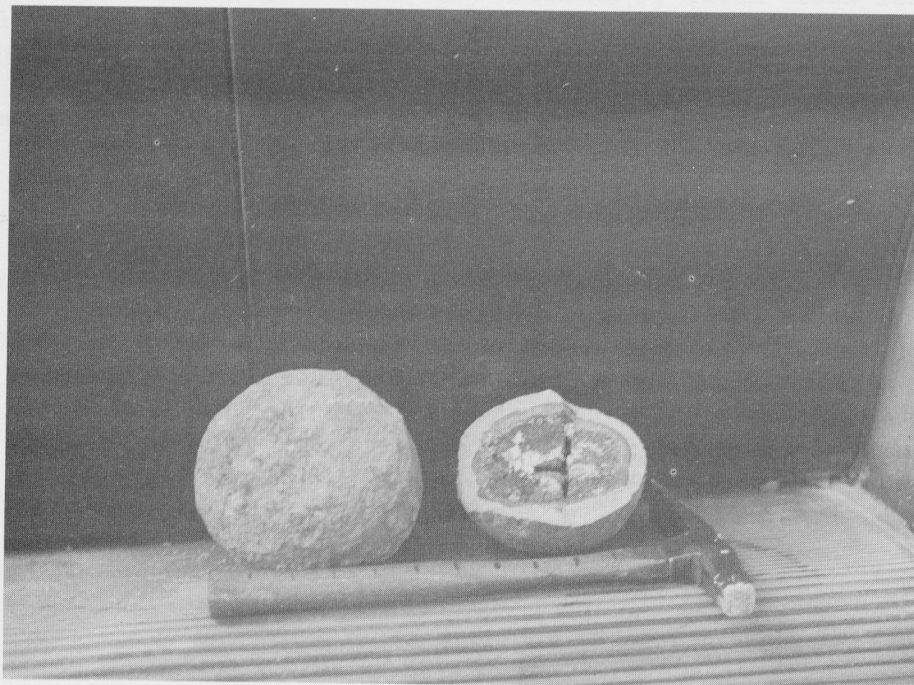
A. CONCRETIONS FROM THE SAN MIGUEL FORMATION ON THE EAST SIDE OF CHAPOTE CREEK, 0.8 MILE NORTH OF MAVERICK COUNTY