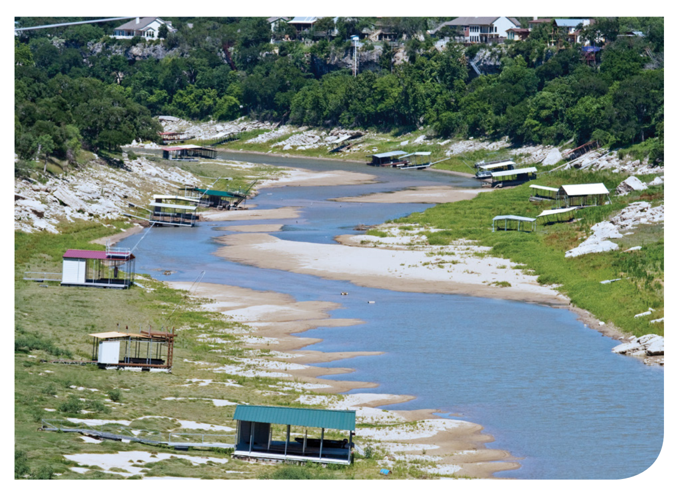
The Pedernales River more than 20 feet below normal levels, leaving the boat docks unusable

In some cases, drought management was recommended only as a near-term, stop-gap strategy to be displaced in later planning decades by projects that provide additional water supplies. Planning groups did not, in general, consider it prudent, sustainable, reliable, and/or economically feasible to adopt a regional plan that would intentionally require restrictions on normal economic and domestic activities, especially when there were feasible alternatives. The effectiveness and sustainability of drought measures varies between utilities and were sometimes not considered to be predictable or reliable enough to quantify for inclusion as a recommended water management strategy. Most planning groups chose instead to leave potential water savings from drought management measures as a back-up or last-resort response to address uncertainty, such as the event of a drought worse than the benchmark drought of record (BBC Research & Consulting, 2009).