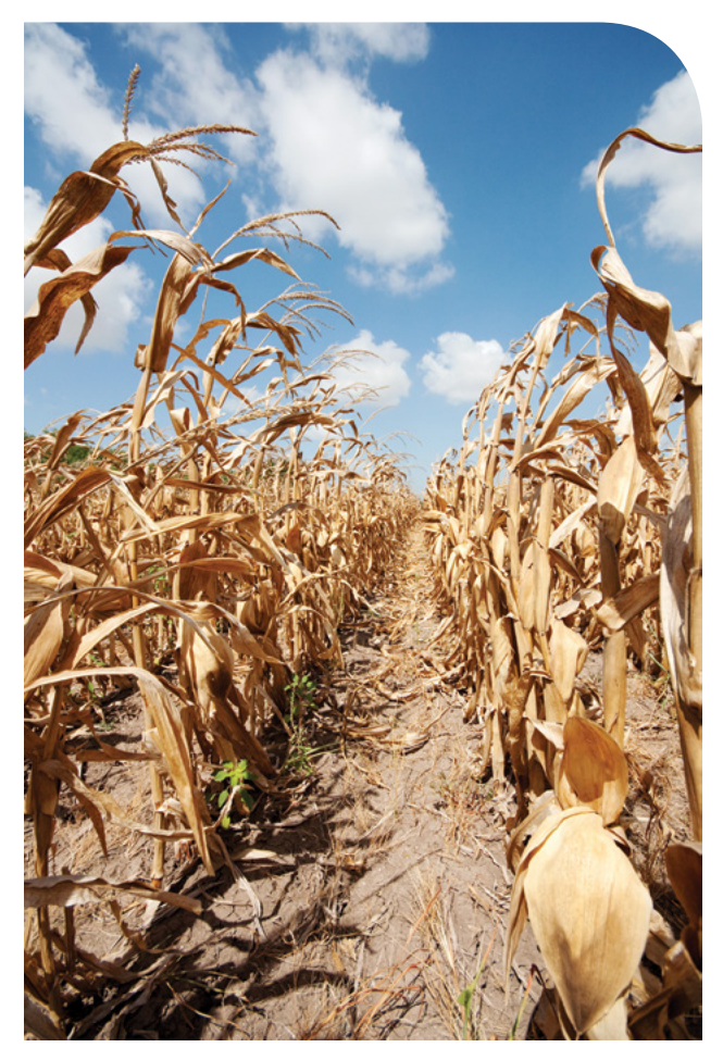
Failed corn crop due to drought in the Lower Rio Grande Valley

Wholesale public water suppliers, retail public water suppliers with 3,300 or more connections, and irrigation districts must develop drought contingency plans and submit them to the Texas Commission on Environmental Quality. Retail public water suppliers with less than 3,300 connections must develop plans and make them available upon request. Investor-owned utilities are also required to develop drought contingency plans. Wholesale and retail public water suppliers must also notify the Texas Commission on Environmental Quality within five days after implementing any mandatory drought contingency plan measures.