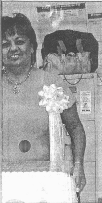
the grandma's baby shower.