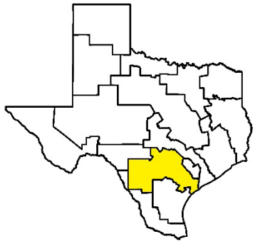
Figure I - South Central Texas (L)