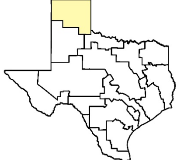
Figure I – Panhandle (A) Regional Water Planning Area