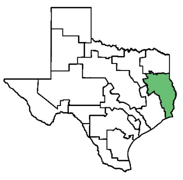
Figure I – East Texas (I) Regional Water Planning Area

Public involvement is a key component to regional water planning. To ensure your water needs are accurately reflected in the 2026 plan, get involved in Region I water planning by visiting <a href="https://www.etexwaterplan.org/">https://www.etexwaterplan.org/</a> or contact the City of Nacogdoches at <a href="mailto:regioniwater@gmail.com">regioniwater@gmail.com</a>, 936-559-2607.