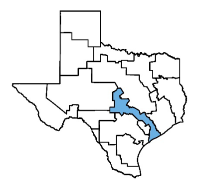
Figure I – Lower Colorado (K) Regional Water Planning Area

Matagorda County is located in the Lower Colorado (K) Regional Water Planning Area, which encompasses all or parts of 14 counties that stretch from the Central Texas Hill Country to the Gulf of Mexico (Figure 1). The Lower Colorado (K) Regional Water Planning Group is responsible for developing a regional water plan every five years based on conditions that the region would face under a recurrence of a historical drought of record. The results of the regional water plan are included in the state water plan and inform state financial assistance and surface water right permitting decisions. The 2026 plan is currently under development and due to the TWDB in October 2025.