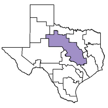
Figure I – Brazos G Regional Water Planning Area

Public involvement is a key component to regional water planning. To ensure your water needs are accurately reflected in the 2026 plan, get involved in Region G water planning by visiting <a href="https://brazosgwater.org/">https://brazosgwater.org/</a> or contact the Brazos River Authority at <a href="mailto:pamela.hannemann@Brazos.org">pamela.hannemann@Brazos.org</a>, 254-761-3135.