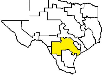
Figure I - South Central Texas (L) Regional Water Planning Area