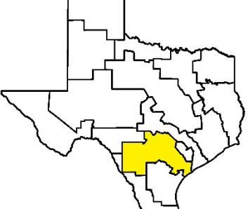
Figure I - South Central Texas (L) Regional Water Planning Area