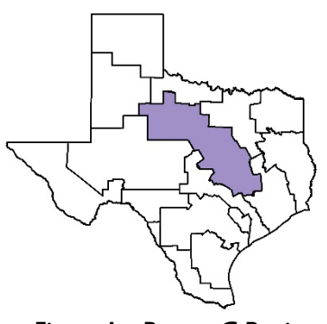
Figure I – Brazos G Regional Water Planning Area

Public involvement is a key component to regional water planning. To ensure your water needs are accurately reflected in the 2026 plan, get involved in Region G water planning by visiting <a href="https://brazosgwater.org/">https://brazosgwater.org/</a> or contact the Brazos River Authority at <a href="mailto:pamela.hannemann@Brazos.org">pamela.hannemann@Brazos.org</a>, 254-761-3135.