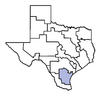
Figure I – Coastal Bend (N) Regional Water Planning Area