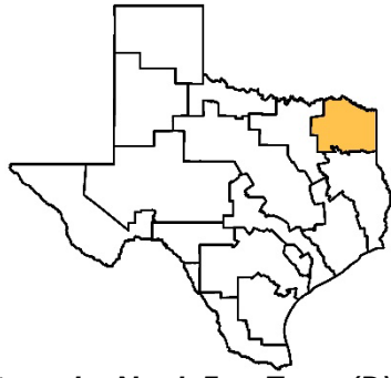
Figure I – North East Texas (D) Regional Water Planning Area

Public involvement is a key component to regional water planning. To ensure your water needs are accurately reflected in the 2026 plan, get involved in Region D water planning by visiting <a href="https://rwrd.org/region-d/">https://rwrd.org/region-d/</a> or contact the Riverbend Water Resources District at <a href="https://www.byledooley@rwrd.org">kyledooley@rwrd.org</a>, 903-831-0091.