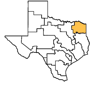
Figure I – North East Texas (D) Regional Water Planning Area