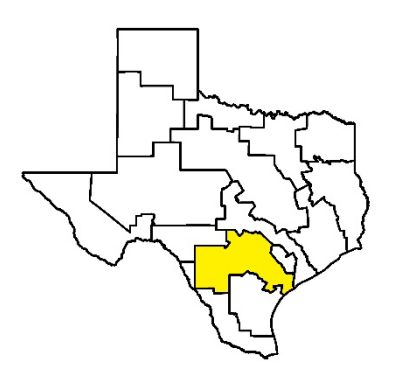
Figure I – South Central Texas (L) Regional Water Planning Area

DeWitt County is located in the South Central Texas (L) Regional Water Planning Area, which encompasses all or parts of 21 counties that stretch from the Central Texas Hill Country to the coastal plains (Figure 1). The South Central Texas (L) Regional Water Planning Group is responsible for developing a regional water plan every five years based on conditions that the region would face under a recurrence of a historical drought of record. The results of the regional water plan are included in the state water plan and inform state financial assistance and surface water right permitting decisions. The 2026 plan is currently under development and due to the TWDB in October 2025.