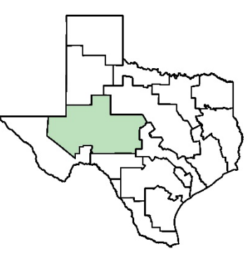
Figure I – Region F Regional Water Planning Area

Public involvement is a key component to regional water planning. To ensure your water needs are accurately reflected in the 2026 plan, get involved in Region F water planning by visiting <a href="https://regionfwater.org/">https://regionfwater.org/</a> or contact the Colorado River Municipal Water District at <a href="https://regionfwater.org/">ahoback@crmwd.org</a>, 432-267-6341.