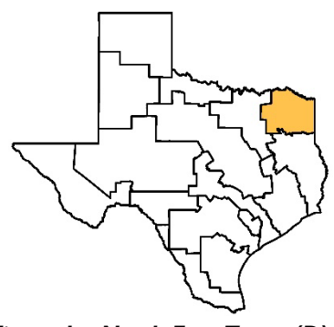
Figure I – North East Texas (D) Regional Water Planning Area

Public involvement is a key component to regional water planning. To ensure your water needs are accurately reflected in the 2026 plan, get involved in Region D water planning by visiting <a href="https://rwrd.org/region-d/">https://rwrd.org/region-d/</a> or contact the Riverbend Water Resources District at <a href="https://www.byledooley@rwrd.org">https://rwrd.org/region-d/</a> or contact the Riverbend Water Resources District at <a href="https://www.byledooley@rwrd.org">https://www.byledooley@rwrd.org</a>, 903-831-0091.