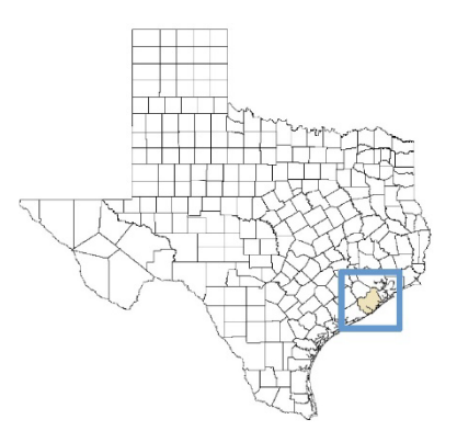
Figure I – Region H Regional Water Planning Area