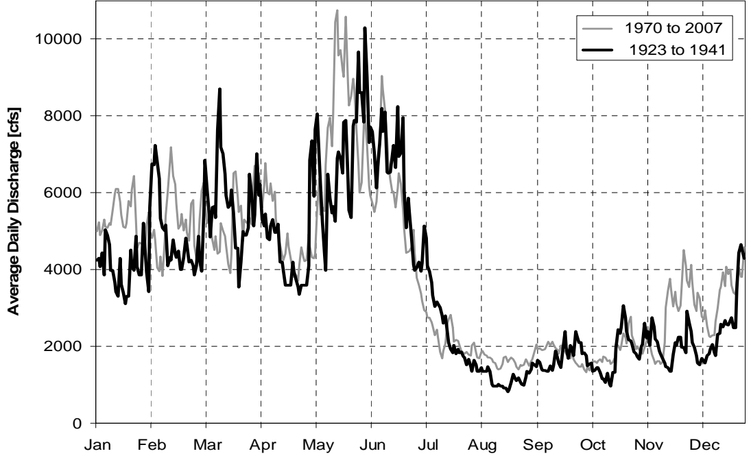
Figure 2. Median of daily discharge values for USGS gage # 08114000, Brazos River at Richmond, TX.