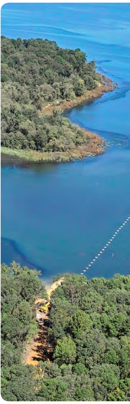
Northeast Texas Municipal Water District, La