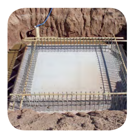
Colorado River Municipal Water District water reclamation facility: benefiting 473,000 customers

Projects shown received TWDB financial assistance.