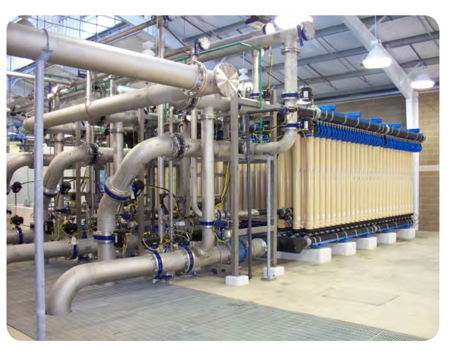
City of Fort Worth Village Creek reclaimed water project

needed? While non-conventional water management strategies can provide timely and cost-effective water supplies in most regions of the state, implementing them is challenging. The actions needed today include collecting and disseminating data and information in a timely manner to potential users; demonstrating the technical feasibility