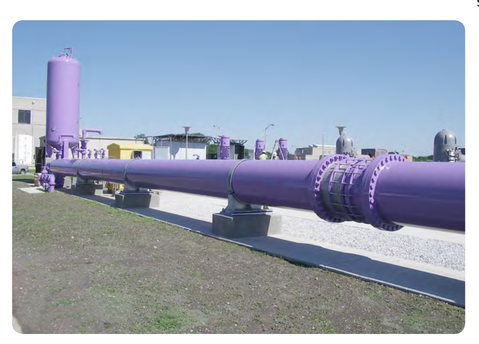
Kempner Water Supply Corporation water treatment plant

acceptance, they present serious challenges that must be overcome (for example, lack of data,