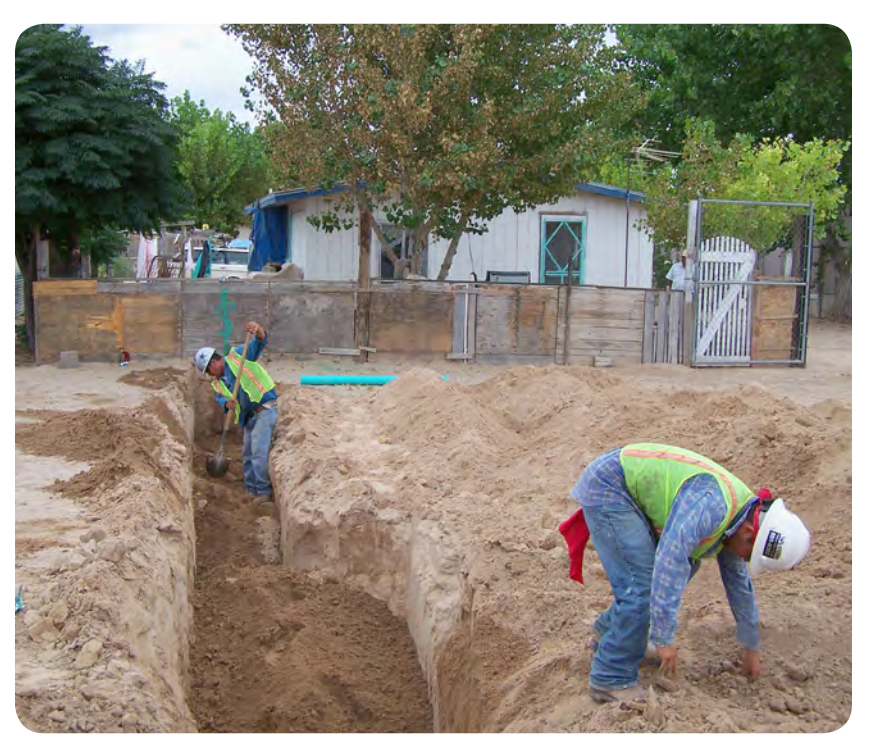
El Paso County Tornillo Water Improvement District wastewater project

If appropriations for program funds are not approved, projects in economically distressed areas would be delayed or not funded. Projects that previously received TWDB planning, acquisition, and design funding would not have EDAP grant/loan funding available to them to begin and complete construction.