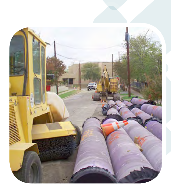
City of Dallas Cedar Crest recycled water pipeline: benefiting 1,260,000 customers