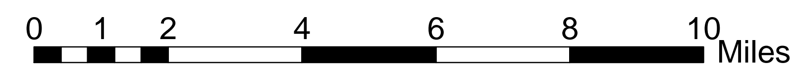
2 1/2 Minute Quadrangles