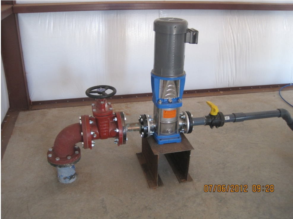
Figure 2. RO system booster pump inside RO building