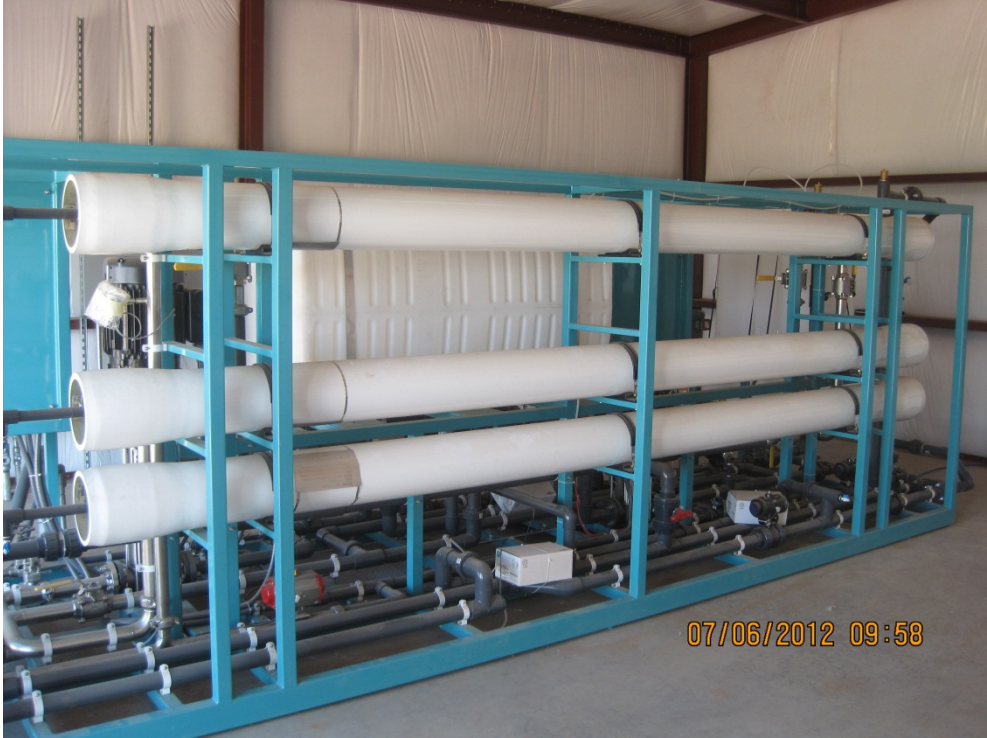
Figure 1. RO system in building