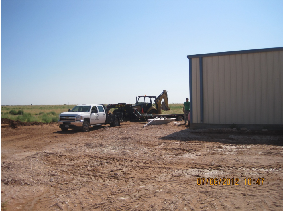
Figure 4. Tejas Partners workers near lift station