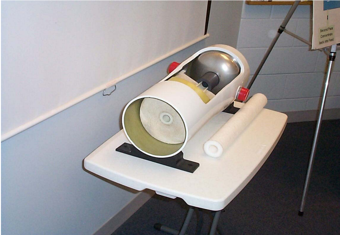
Figure 1- A cross-sectional view of a pressure vessel with a spiral-wound RO membrane