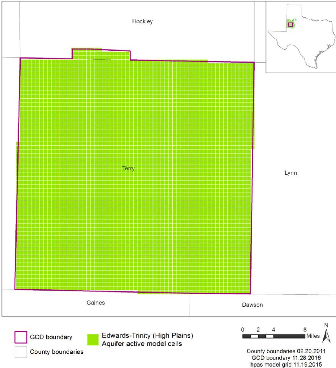
FIGURE 2. AREA OF THE GROUNDWATER AVAILABILITY MODEL FOR THE HIGH PLAINS AQUIFER SYSTEM FROM WHICH THE INFORMATION IN TABLE 2 WAS EXTRACTED (THE EDWARDS-TRINITY (HIGH PLAINS) AQUIFER EXTENT WITHIN THE DISTRICT BOUNDARY).