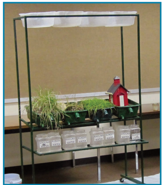
The rainfall simulator shows how land cover and impervious surfaces affect the path of rainwater in a watershed.