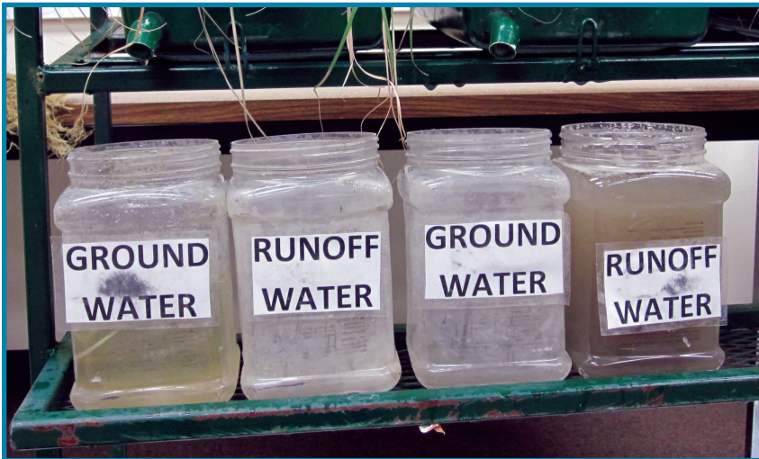
Use clear plastic containers to collect the groundwater and surface runoff and label them (as seen above).