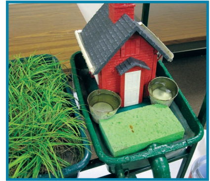
On the urban landscape tray, a small model house (a birdhouse) can represent roof surface. The impervious ground is a piece of plastic glued to the tray. Use small containers to simulate rain barrels and a sponge to simulate a rain garden. The gutters are made from 1/2-inch pipe cut in half.