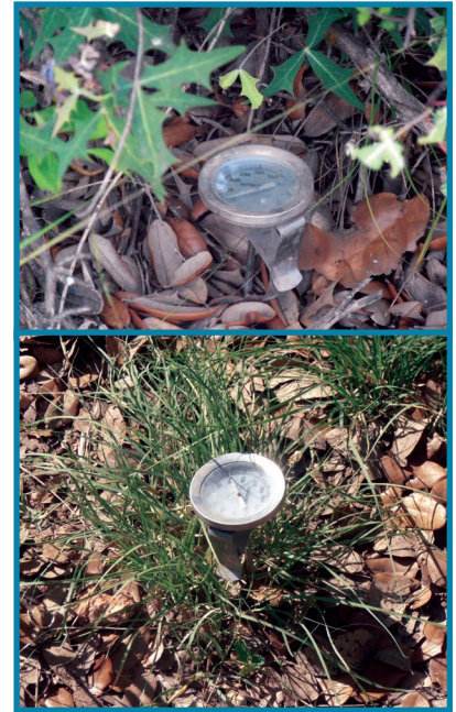
The thermometer on the top is in shade and in litter. The one on the bottom is in full sun and short grass with little litter.