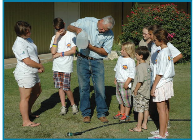
Add an adjustable drip emitter to a 1-gallon jug to make a watering device for wildlife.