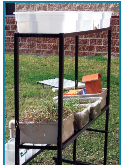
The rain trays are the same size containers as the plant trays. They are drilled with 35 small holes (1/16 inch) across the bottom for the water to simulate rainfall.