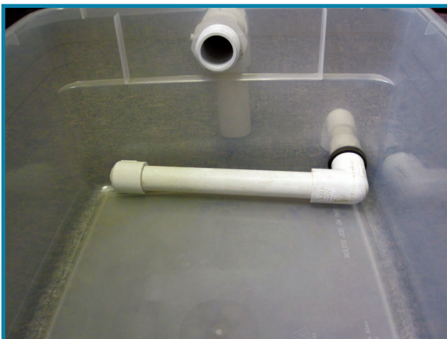
There are two drains in the tray: one for groundwater and one for surface water runoff. The groundwater drain is made from 1/2-inch PVC pipe. As shown above, the pipe extends along the bottom of the tray to maximize groundwater capture. The surface water hole drilled into the tray is 1 1/2 inches in diameter, and the hole for the groundwater pipe is 7/8 inch in diameter.