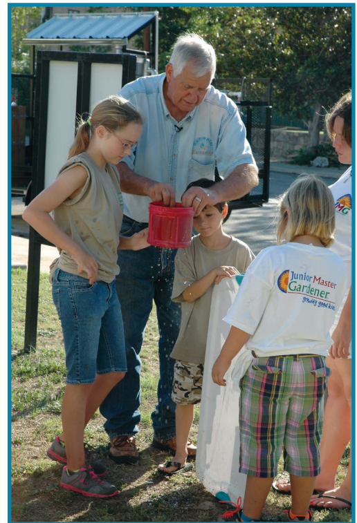
The difference in splash patterns from an area of bare soil and a vegetated one shows how vegetation helps protect soil particles from erosion and runoff.