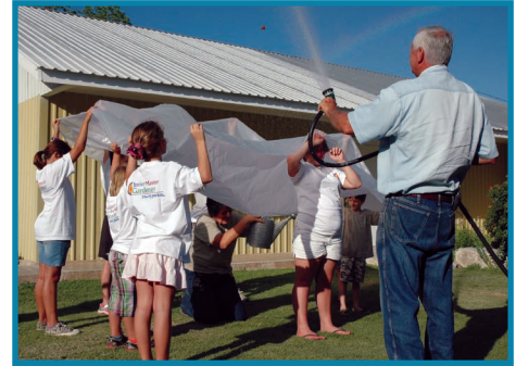
The “roof” can be a catchment area to harvest the water for later use.