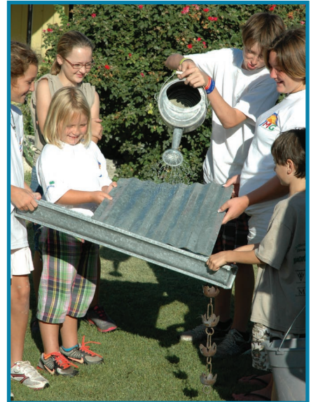
Gutters direct the flow of rainwater from a roof so it can be captured in a rain barrel for later use.