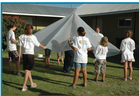
Rainwater runs from the “roof” to the ground.