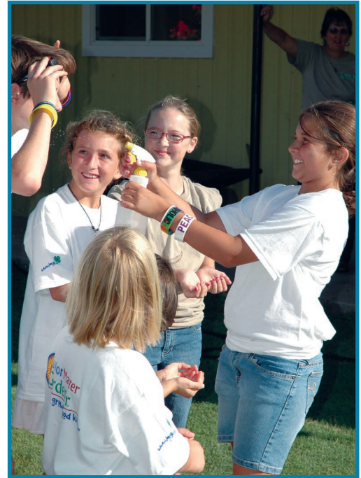
The difference in the effects of a mist and a heavy water spray helps students visualize how rainfall rates can affect erosion and water runoff.