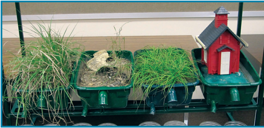
Once the trays and piping have been assembled, they can be filled with "land uses." In this picture, there are land uses of (from left to right) native grasses, overgrazed land, turfgrass, and urban landscape. Note that the water pipes in this example use 45-degree elbows.