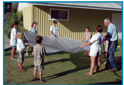
It takes teamwork to move the water around the plastic sheet without losing or wasting it.