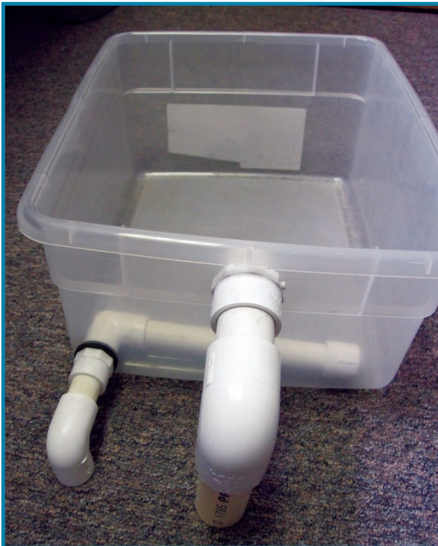
The plant tray for the simulator is made from a 15 inch x 11 inch x 6 inch plastic storage (15-quart volume) container.