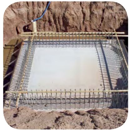
Colorado River Municipal Water District water reclamation facility: benefiting 473,000 customers

Projects shown received TWDB financial assistance.