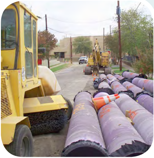
City of Dallas Cedar Crest recycled water pipeline: benefiting 1,260,000 customers