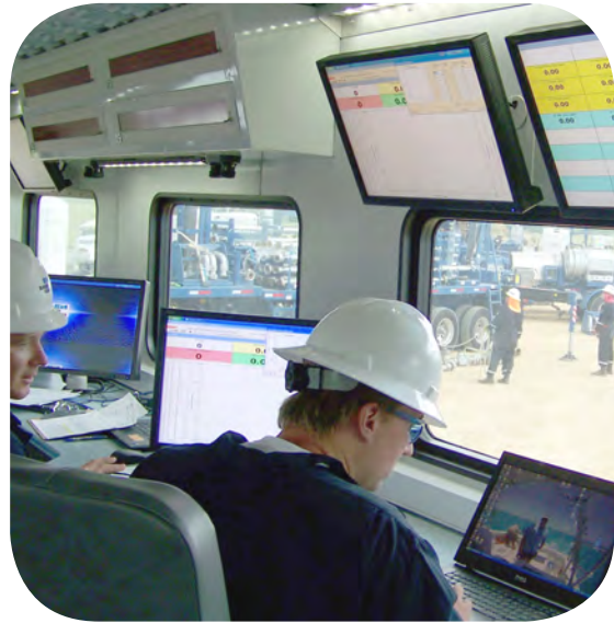
San Antonio Water System brackish groundwater desalination: benefiting 1,349,041 customers