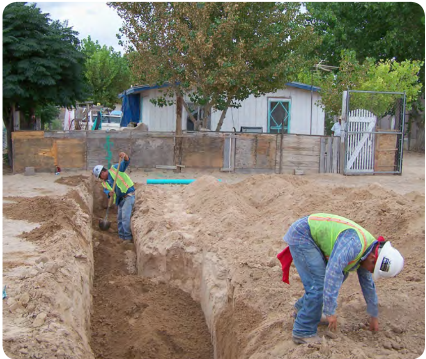
El Paso County Tornillo Water Improvement District wastewater project

If appropriations for program funds are not approved, projects in economically distressed areas would be delayed or not funded. Projects that previously received TWDB planning, acquisition, and design funding would not have EDAP grant/loan funding available to them to begin and complete construction.