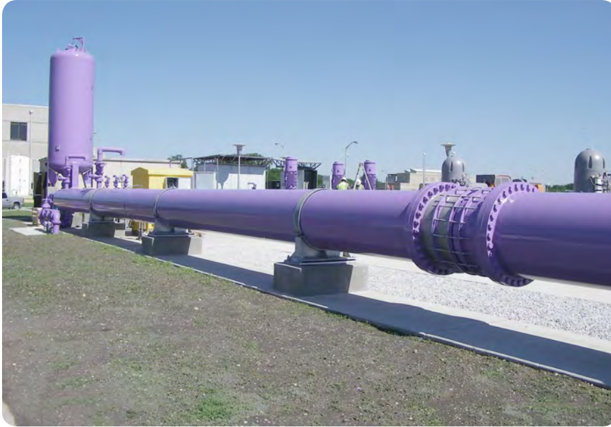
Kempner Water Supply Corporation water treatment plant

The drought of 2011 brought into sharp focus the state's reliance on conventional water supplies. It