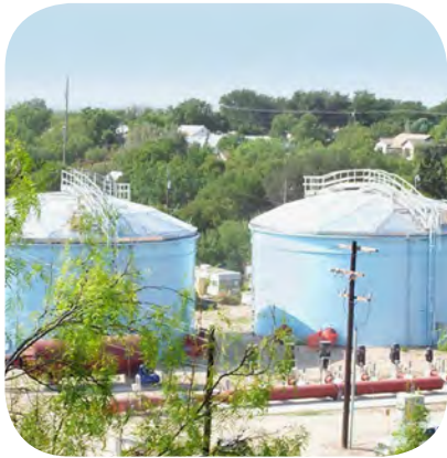
City of Eagle Pass water treatment plant: benefiting 40,000 customers