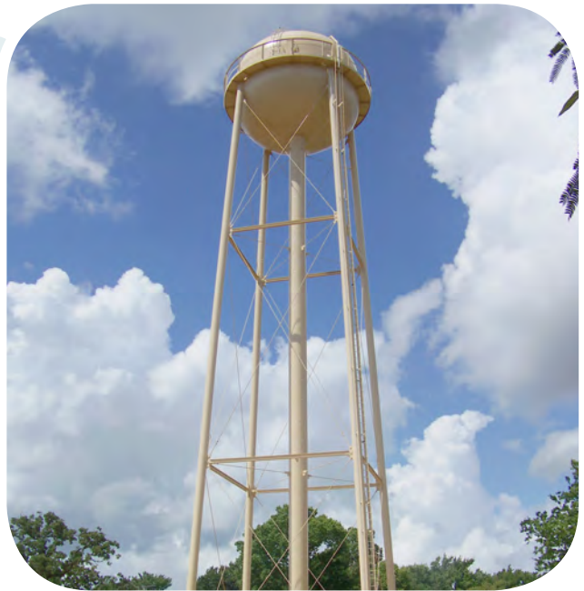
Gause Water Supply Corporation elevated storage tank: benefiting 927 customers

Projects shown received TWDB financial assistance.