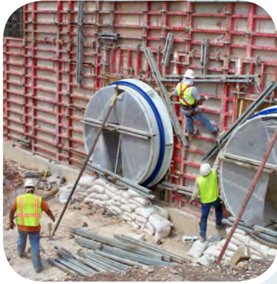
Brushy Creek Regional Utility Authority water treatment plant: benefiting 192,354 customers

Projects shown received TWDB financial assistance.