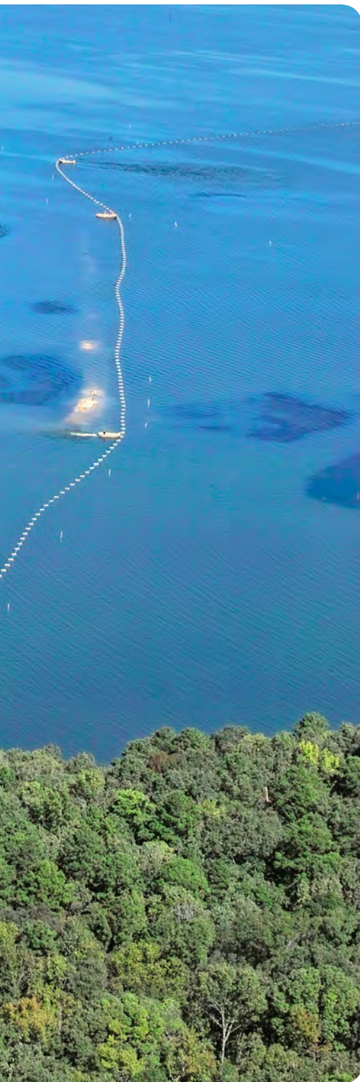
ke O' The Pines transmission pipeline project