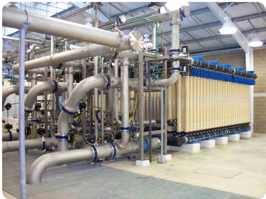
City of Fort Worth Village Creek reclaimed water project