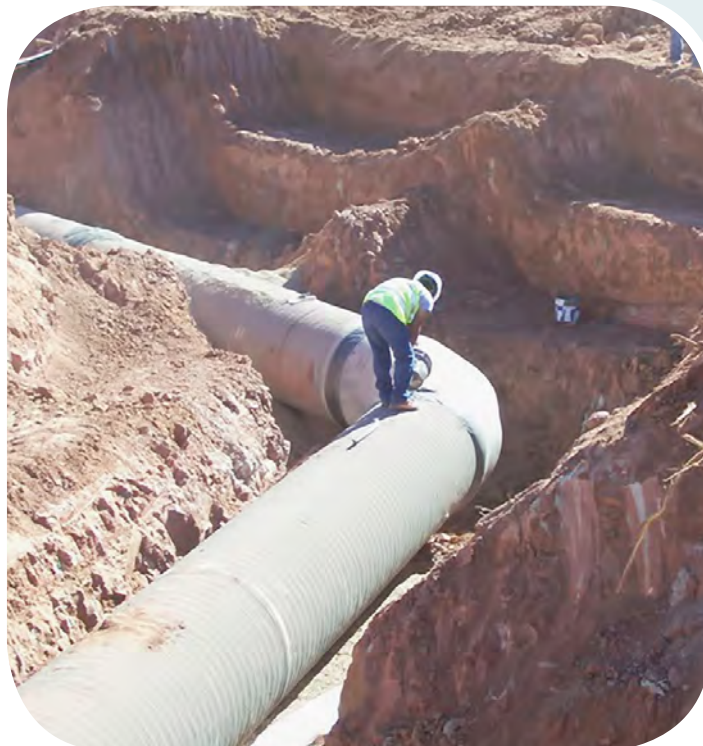
City of Lubbock Lake Alan Henry raw water pipeline: benefiting 233,606 customers

Projects shown received TWDB financial assistance.