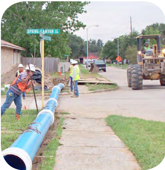
Central Harris County Regional Water Authority surface water supply system: benefiting 26,000 customers

Projects shown received TWDB financial assistance.